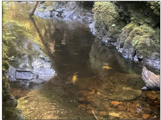
Figure 3.—Channel with adult pink salmon present at waypoint 1041.