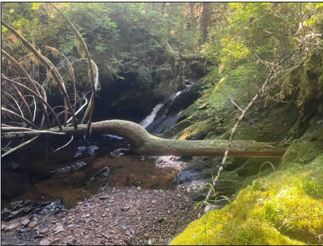
Figure 2.—Bedrock falls barrier at waypoint 1041.