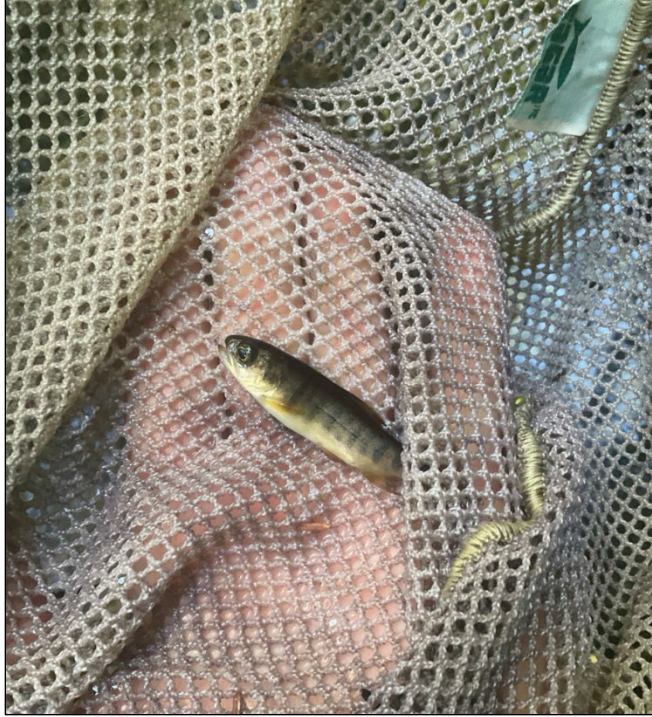
Figure 1.—Juvenile coho salmon caught at waypoint 1041.